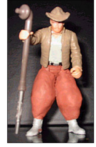
Torgo Action Figure!!!