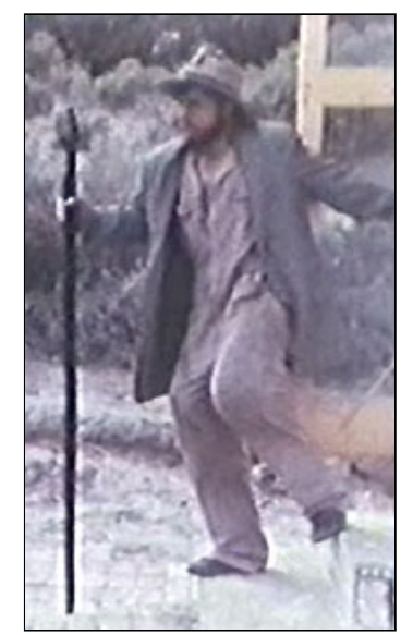
Who's that guy with the big big knees?