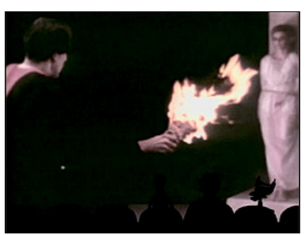
Anyone for BBQ'ed Torgo hand?