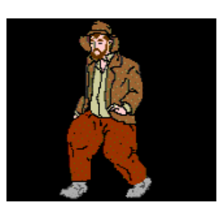
The Torgo Screen Saver!!! For <u>AfterDark for Mac</u> or <u>Windows</u>. Now avalible for <u>Mac OS X</u>!!!