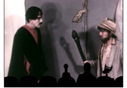
Watch out Torgo, The Master does not approve...