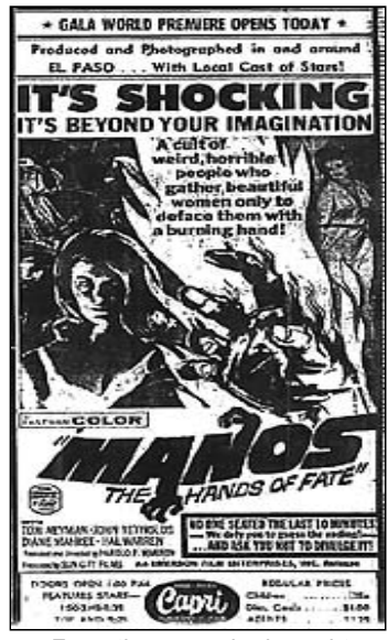
From the man who brought you your lawn fertilizer!